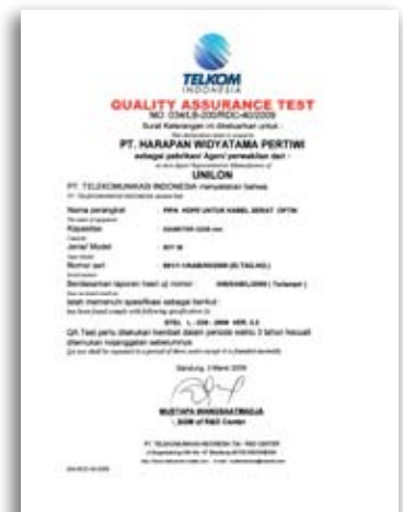
HDPE Pipe for Fiber Optic Cables, Diameter 32/28 mm