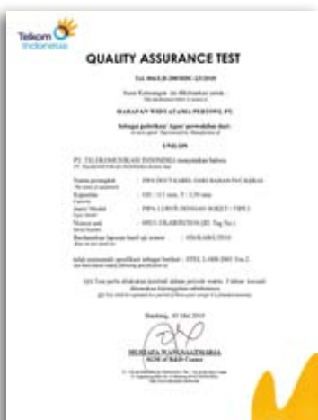
PVC Pipe for Duct Cable, OD : 111 mm