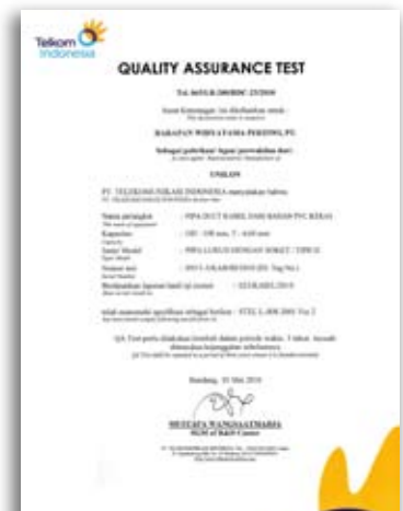
PVC Pipe for Duct Cable, OD : 1108 mm