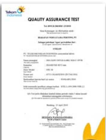
HDPE Pipe for Fiber Optic Cables, Diameter 40/33 mm