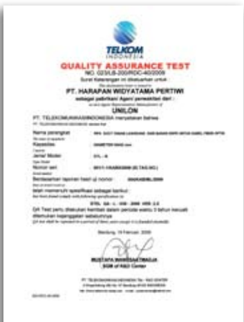
HDPE Pipe for Fiber Optic Cables, Diameter 50/42 mm