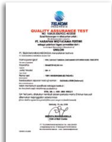
HDPE Pipe for Fiber Optic Cables, Diameter 40/34 mm