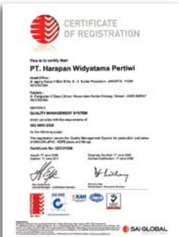
Quality Management System, ISO 9001:2008, SAI GLOBAL