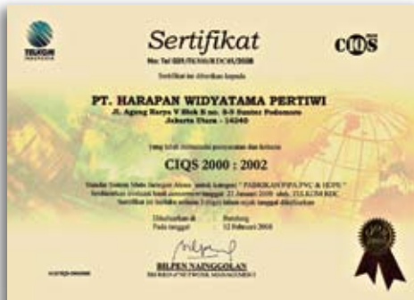
CIQS 2000 : 2002