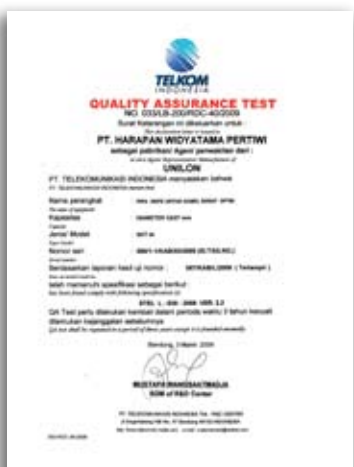
HDPE Pipe for Fiber Optic Cables, Diameter 32/27 mm