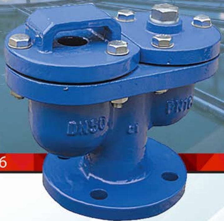
AIR-V FL CI YUTA DOUBLE PN16